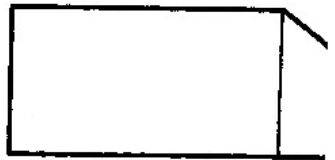
a ladybug in a box