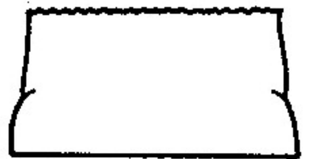
a bee in a bag