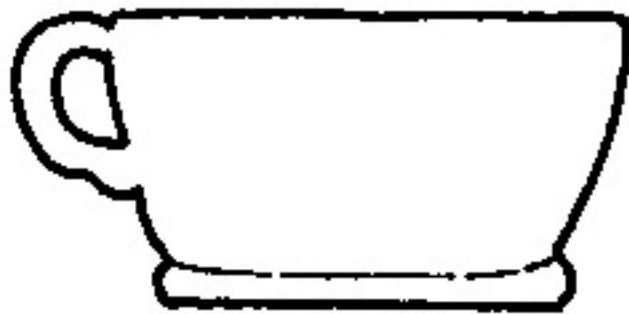
a caterpillar in a cup